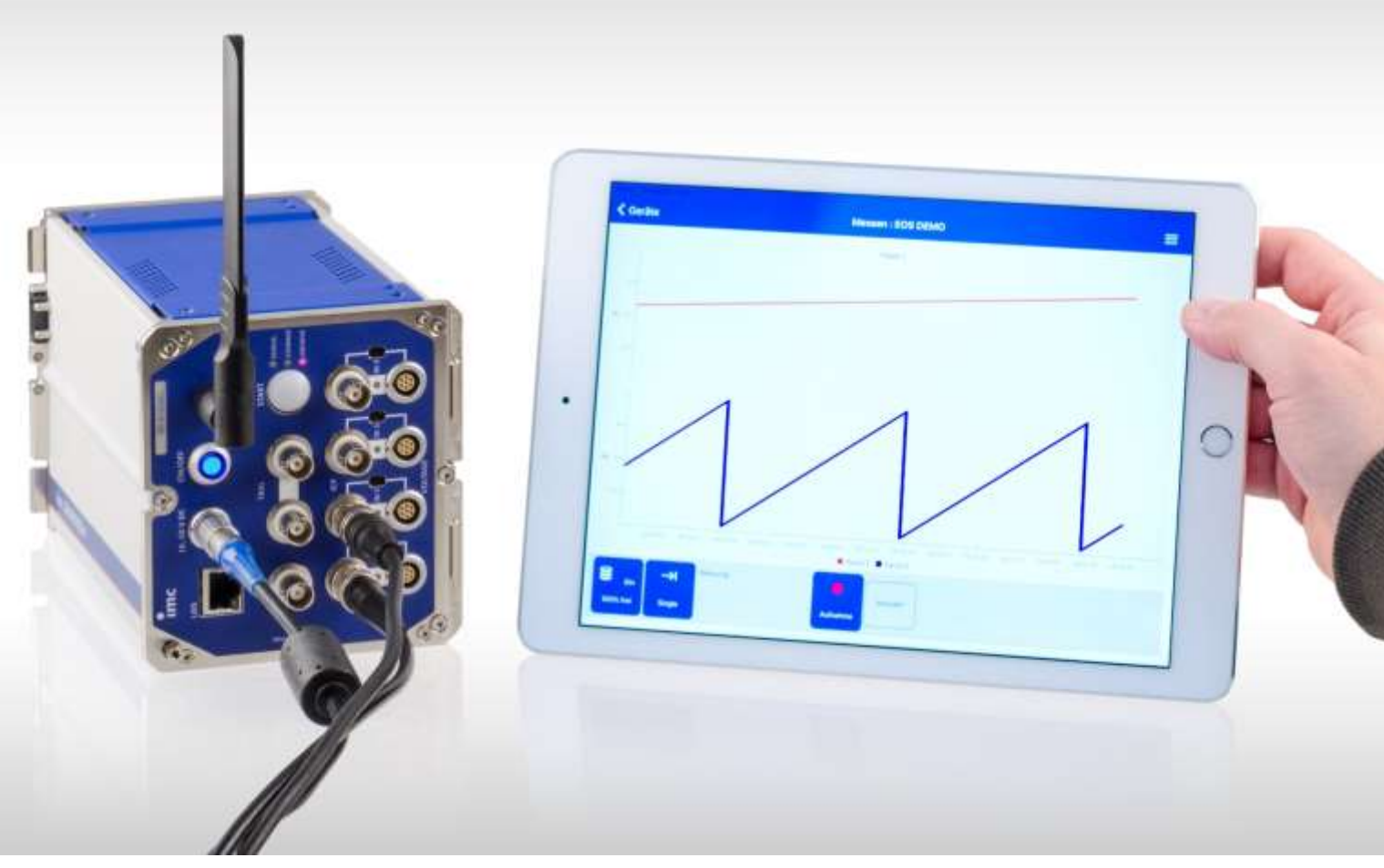
Fig. 1: imc EOS captures signals at 4 MHz

The demands placed on modern test environments are constantly increasing. In addition to the acquisition of purely physical quantities such as pressure, temperature, voltage and so forth, fast signals from electromechanical controls, for instance, must also be acquired in high resolution. This demands new measurement concepts that combine "slow" and "fast" data acquisition synchronously.