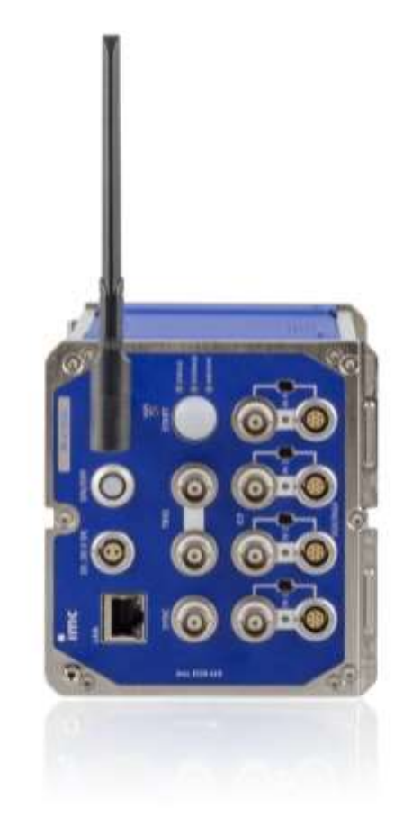
Fig. 2: imc EOS-U4 with integrated WLAN

also vibration, (structure-borne) noise, and explosion and ignition processes with sampling rates of up to 4 MHz. This measurement device has a BNC or LEMO interface to acquire these high-frequency signals. Precision current transformers are also supported. imc EOS can be used as a high-speed recorder and directly measure voltage signals up to ± 60 V. imc EOS also supports IEPE/ICP sensors such as accelerometers, microphones and force sensors for the acquisition of other high-frequency signals like sound or vibration. imc EOS offers high signal quality, because the analogue bandwidth extends up to 1.7 MHz and digitizes the acquired signals with 24 bits at up to 4 MHz per channel.