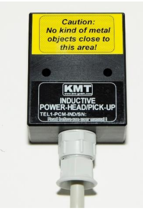
PH-PU-CRS with cable rear side out