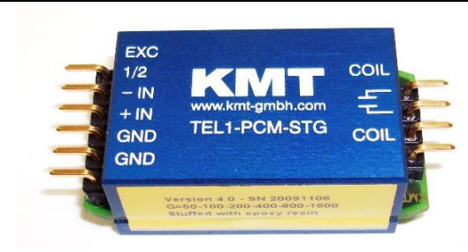
With built-in 220nF capacitor for shaft up to 400mm recommend! Standard version!