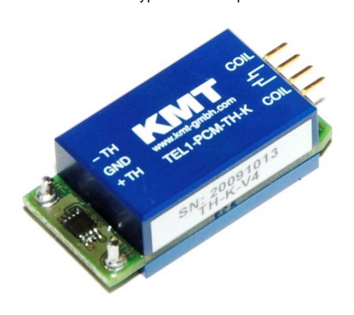
with solder pins for thermocouple

Analog signal bandwidth: 0 - 10 Hz (-3 dB) Accuracy: +/-0.5 % (without sensor) Operating temperature: - 40 to + 85 °C