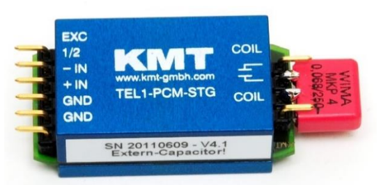
Without built-in capacitor. Only with external capacitor! E. g. 100nF for larger shaft >400mm! Specify at order!