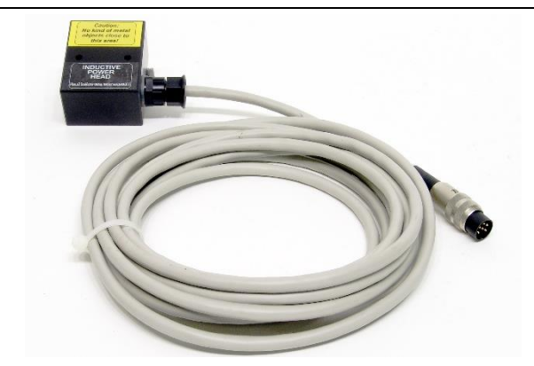
PH-PU Standard with ride side cable out