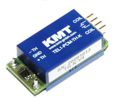
with solder pins for thermocouple

Analog signal bandwidth: 0 - 10 Hz (-3 dB) Accuracy: +/-0.5 % (without sensor) Operating temperature: - 10 to + 80 °C