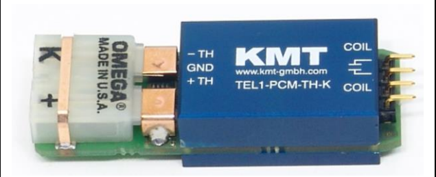
with female K type thermocouple connector

Housing: splash-water resistant (except the connector pins)