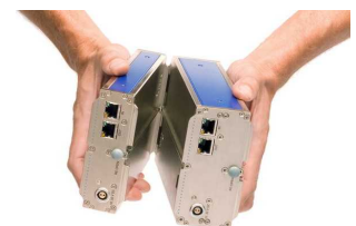
imc Click Mechanism

Alternatively, connection can be made by means of standard Ethernet cables (RJ45, CAT5), thus creating a spatially distributed system.