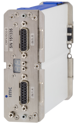
CRFX/ISO2-8 module shown in standard operating orientation