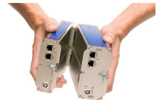
imc Click Mechanism

Alternatively, connection can be made by means of standard Ethernet cables (RJ45, CAT5), thus creating a spatially distributed system.