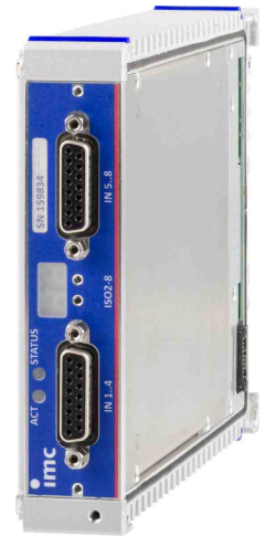
CRXT/DI2-16 (Fig. similar)