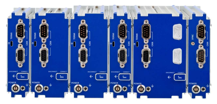
rear view of this block: CAN, Power supply, Terminator, Locking slider