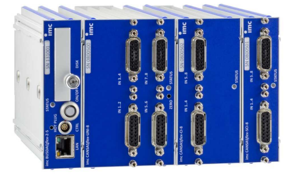
imc CANSAS flex modules connected (Click-mechanism) in a block with imc BUSDAQ flex Logger (left)