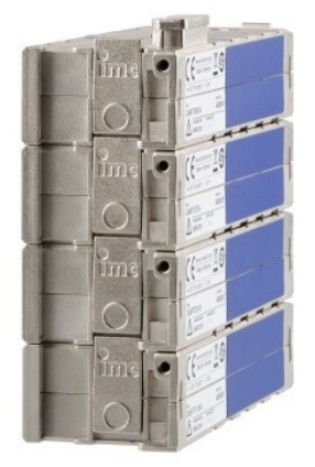
Latching mechanism and protective cover for click mechanism