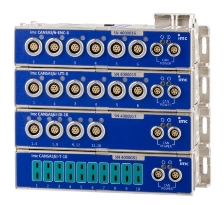
imc CANSASfit modules connected in a block (click mechanism)

• Fastening eyelets provided for installation with cable ties, srews or bolts