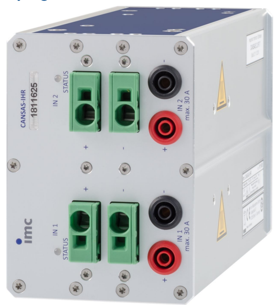
imc CANSAS-IHR (CAN/IHR)