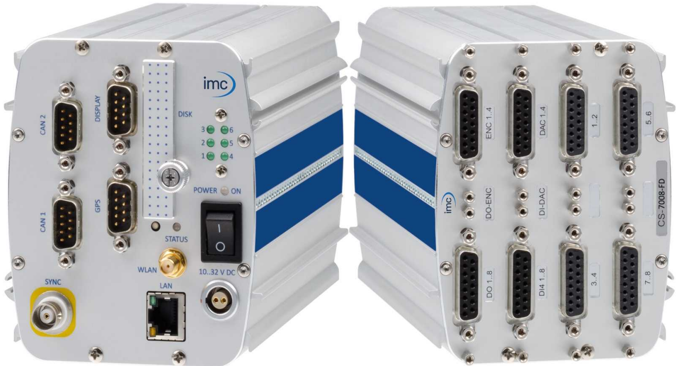
device type: CS-7008-FD, 8 analog measurement inputs

Universal and powerful compact measurement system