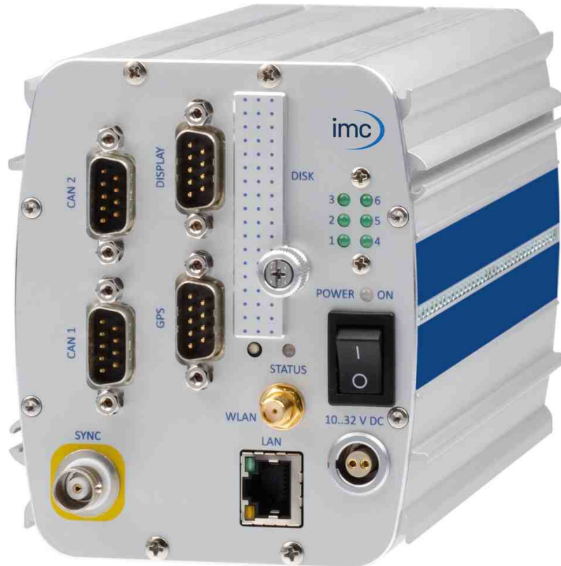
device type: CS-3008-FD (Fig. similar), 8 analog measurement inputs

Compact measurement system for noise and vibration testing