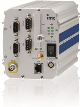
Compact measurement device: imc C-SERIES

For its Weigh-in-Motion system, the customer Pt Struktur Pintar Indonesia uses imc C-SERIES measurement systems having real-time calculation functionality.