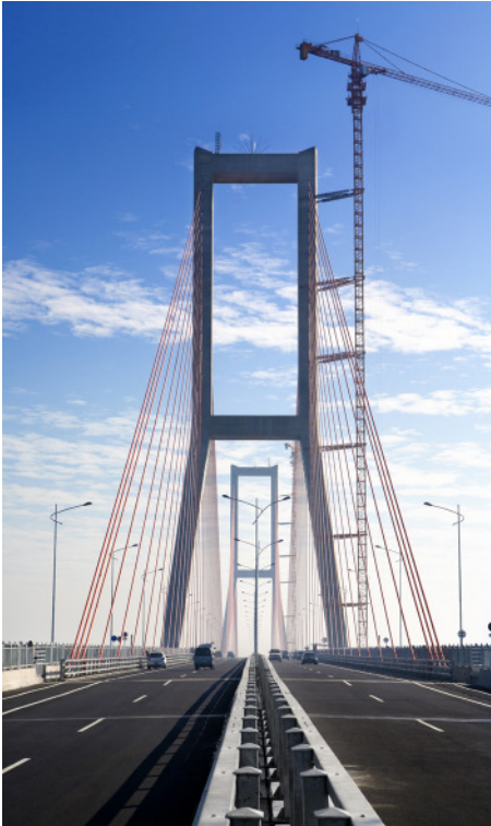
SuraMadu Bridge, Indonesia

At 5.5 Kilometers, the Suramadu Bridge is the longest in Indonesia. This cable-stayed toll bridge connects the cities of Surabaya on the island of Java and Bangkalan on the island of Madura. It has two lanes in each direction plus additional lanes for emergency vehicles and motorcycles.